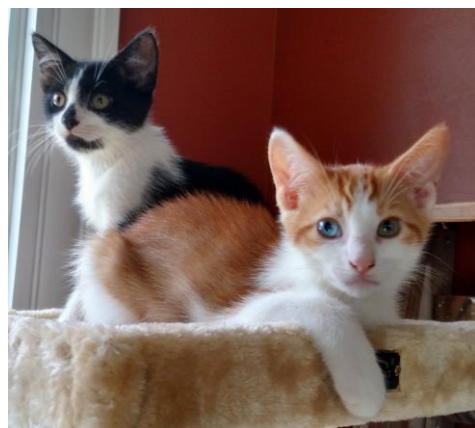
Zorro and Rebel