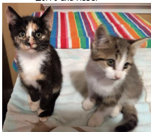
Two Un-Named Sisters